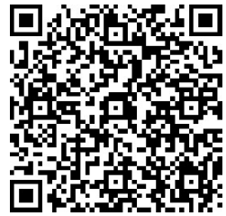
Legal Volunteer Survey